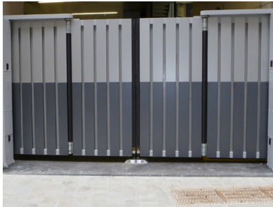
Example 3 Bi-Folding Speed Gate Aluminium Clad