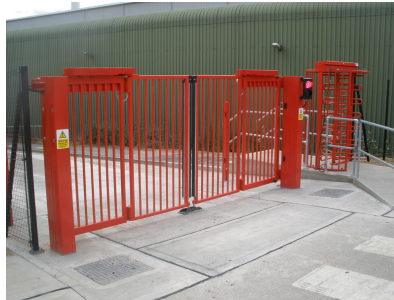
Example 1 Bi-Folding Speed Gate (Top Chain)